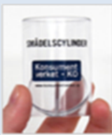
How to use the small part cylinder.

The small part cylinder helps you to find out, what kind of small things, that can be dangerous and can get stuck in your child's throat and choke your child!